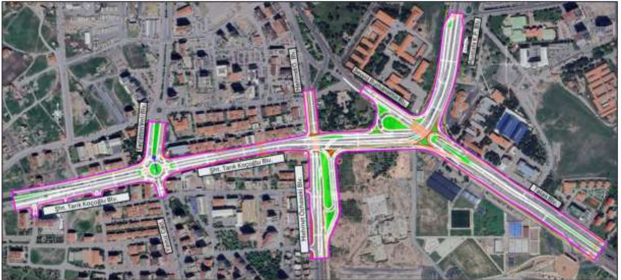
Figure-1.2: K1 Underpass, Tunnel, Pedestrian Underpass, K2 Underpass, Tunnel, Pedestrian Underpass and K3 Underpass plotted on a map.