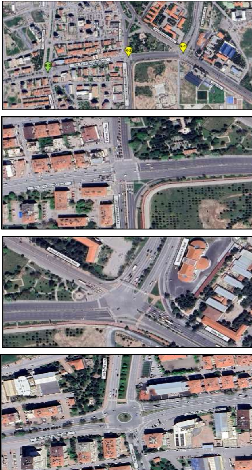
Figure-3: Kartal Junction and Connection Roads Construction Sub-Project