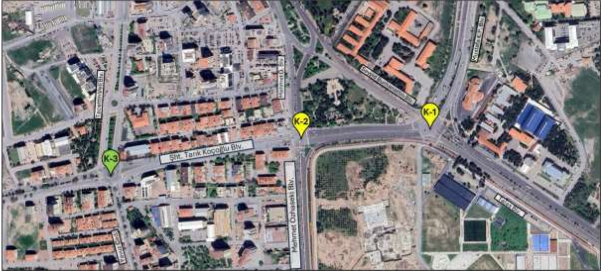
Figure-1.1: K1, K2 and K3 Intersection in current situation.